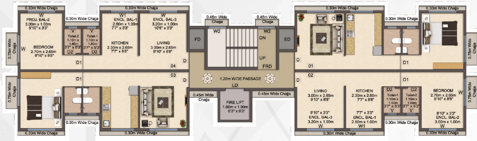
TYPICAL 1st To 5th FLOOR PLAN